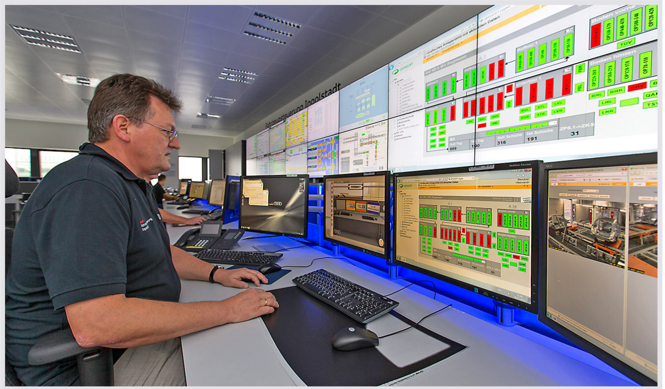
Audi Ingolstadt: Control center from JST

Stylish limousines, sporty allrounders and sleek coupes – more than 2,500 cars roll off the production line at the Audi plant in Ingolstadt every day, in 2013 more than 570,000 cars were produced here. To ensure that production never comes to a standstill, more than 30 employees in three shifts ensure that everything runs smoothly. JST – Jungmann Systemtechnik® – has created the ideal conditions for this. A future-oriented control center has been installed at the Audi plant in Ingolstadt, which makes it possible to control the entire production of the various model series via virtual IT technology. A novelty in the Volkswagen Group, in which the new control center plays a highly regarded pioneering role.