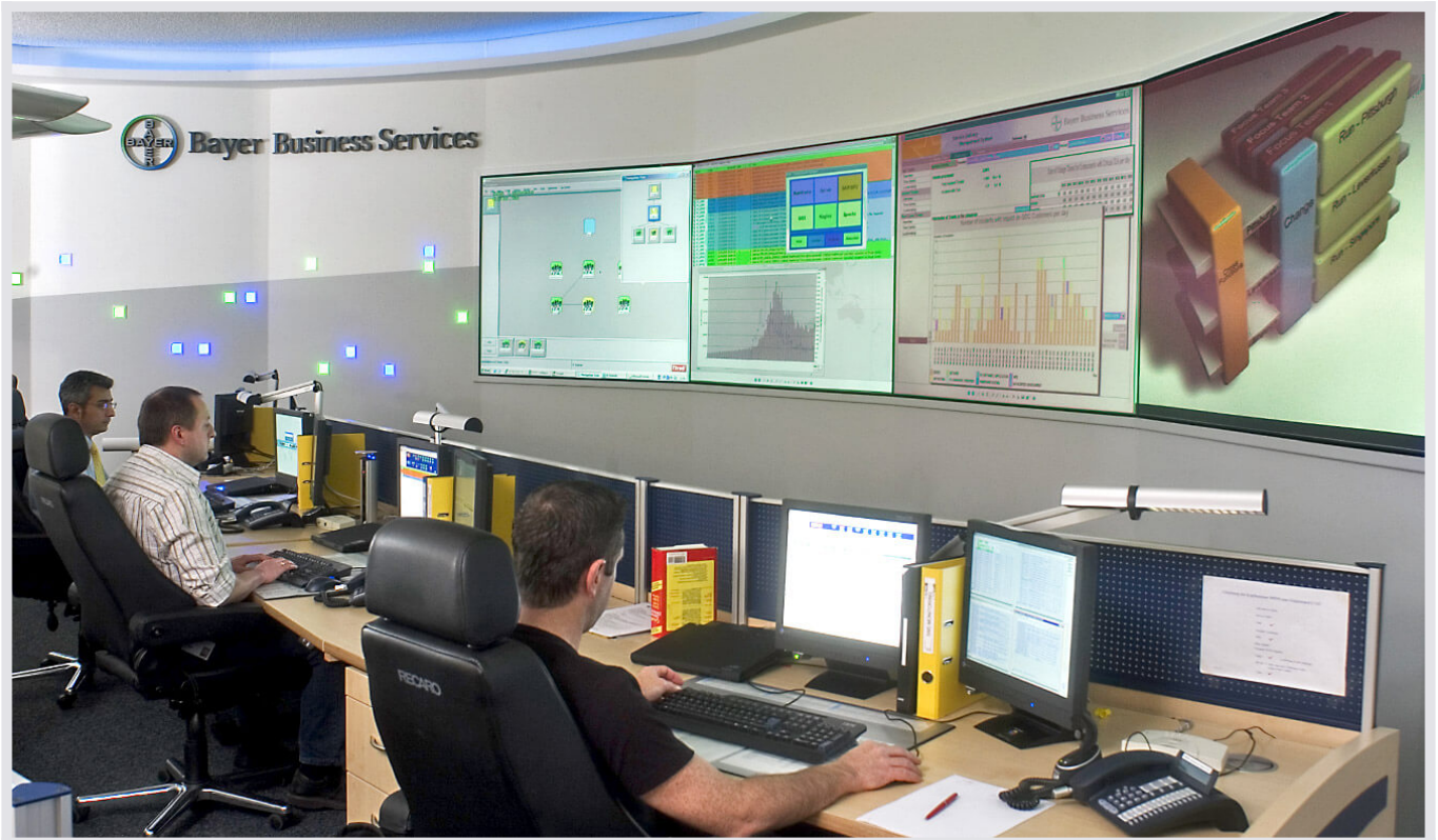
Control center of the Global Data Center in Leverkusen

Bayer Business Services is the Bayer Group's international competence center for IT-based services.