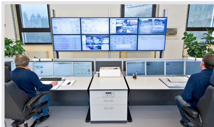
JST control center table: The upper rear wall panels of the Stratos control center desks are equipped with magnetic decorative strips JST furniture: A custom-made product from JST – a radio was integrated into the centrally placed storage container at the customer's request