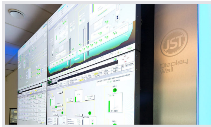
JST Large display wall: The design strips with high-quality aluminium brushed surface and the AmbientLight give the large display wall the distinctive JST look.

A visit by the operators and engineers in charge at the control room simulator of JST completed the decision. “On site we were able to see for ourselves that it is possible to integrate the new MultiConsoling ® technology into our existing plant step by step”, says Ulrich Döring, who also sees it as positive that the JST technology does not necessarily affect the existing control system.