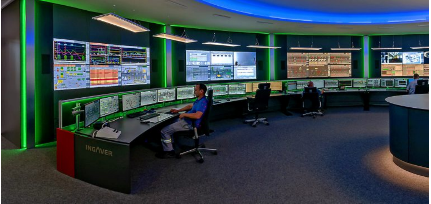
Virtual 360° tour through the control room.

The employees also rate the INGAVER control room as thoroughly positive. They were involved in the planning at an early stage of the project. Made possible by virtual tours thanks to photo-realistic 3D plans , produced by the JST specialists.