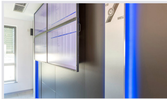
JST Display wall: Two DisplayWalls with four 46-inch displays of the SlimLine series allow the operator team a perfect visualization of all incoming messages.

In retrospect, Jörg Echternach also describes a 3D planning project commissioned in advance from Jungmann, which enabled a comprehensive visualization of the future security area, as "extremely useful and important planning aid". The company was initially somewhat skeptical when it came to the advantages of integrating large-format screens into workflows. "And that is exactly what we never want to do without today. They represent a clear added value for our clients in the provision of services," report the project managers.