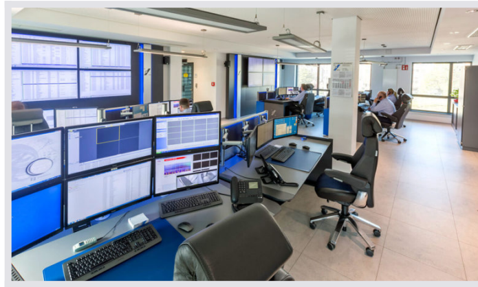
JST control room: The detailed implementation of the previous plans.