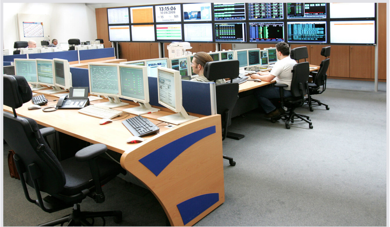
VW Wolfsburg. Enterprise Command Center.

In the Enterprise Command Center (ECC), mainframe, servers and networks are monitored and controlled in 7/24-hour operation. JST carried out the room planning and delivery of the special furniture for the IT control center.