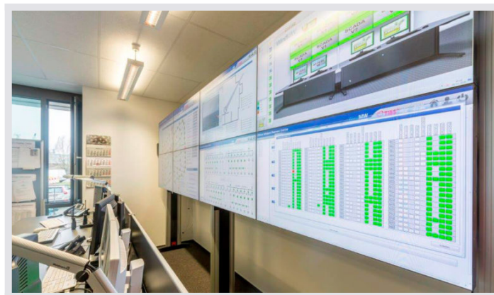
JST large display wall: The JST-DisplayWall with 8 46" displays keeps the entire control center team informed about the most important events